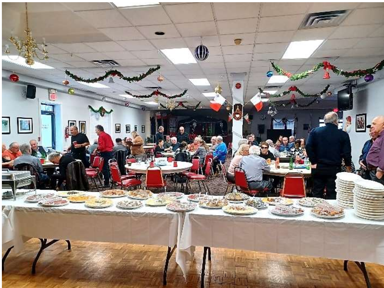
See pages 23-24.